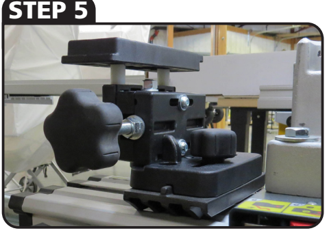
REATTACH TOP PLATE TO PRECISION ADJUSTMENT BLOCK WITH LONGER SCRFWS