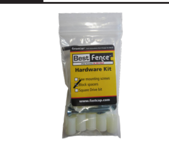
LOCATE BAG OF SPACER HARDWARE INCLUDED WITH YOUR SYSTEM