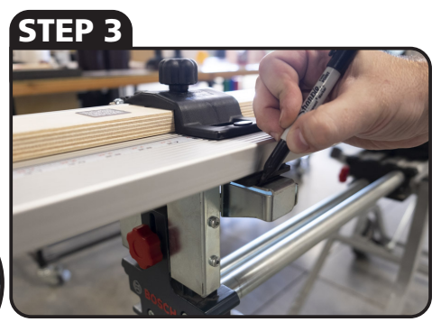
MAP PLACEMENT FOR ADAPTER BLOCK AND ALIGN