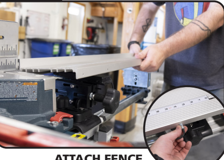
ATTACH FENCE AND INSERT PIN