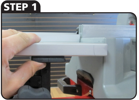
SOME SAWS HAVE HIGHER DECKS REQUIRING SPACERS FOR PRECISION ADJUSTMENT BLOCKS