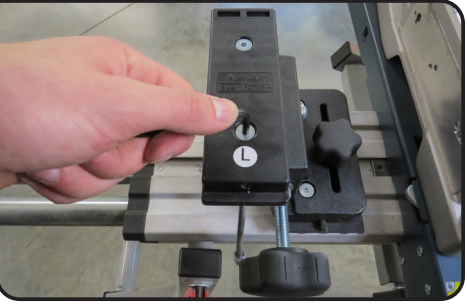
REMOVE FENCE AND UNSCREW TOP PLATE FROM BLOCK WITH INCLUDED WRENCH