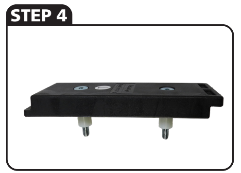
INSTALL INCLUDED SPACERS TO TOP PLATE