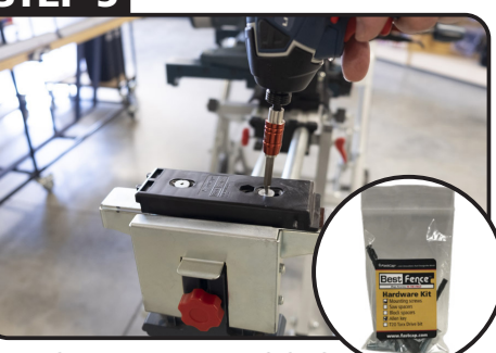
ATTACH ADAPTER BLOCKS USING PROVIDED HARDWARE