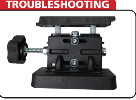
IF THERE IS EXCESS MOVEMENT IN THE PRECISION ADJUSTMENT BLOCK TIGHTEN THE ALLEN SCREWS

SOME FEATURES AND ACCESSORIES MAY NOT BE INCLUDED WITH YOUR SYSTEM. PLEASE VISIT WWW.FASTCAP.COM FOR MORE DETAILS.